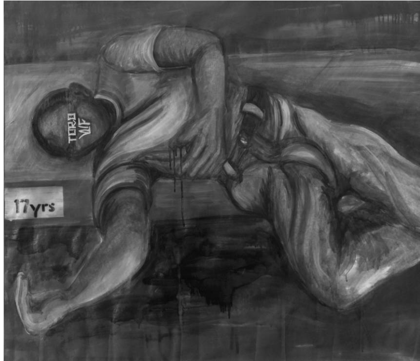
Figure 8 Judy Baca, Dead Homeboy Killed by a Placa (1974), wood stain on paper, 32 × 42 inches. Color version available as an online enhancement.