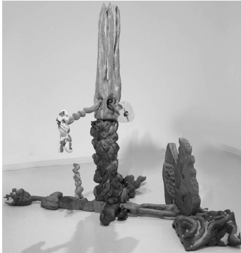
Figure 6 Nancy Azara, Widows' Tongues (1974), painted wood, 8 × 9 feet. © Nancy Azara. Reprinted with permission. Color version available as an online enhancement.

space rather than closing off their surroundings, interacting with the air around them much as human limbs actually do.