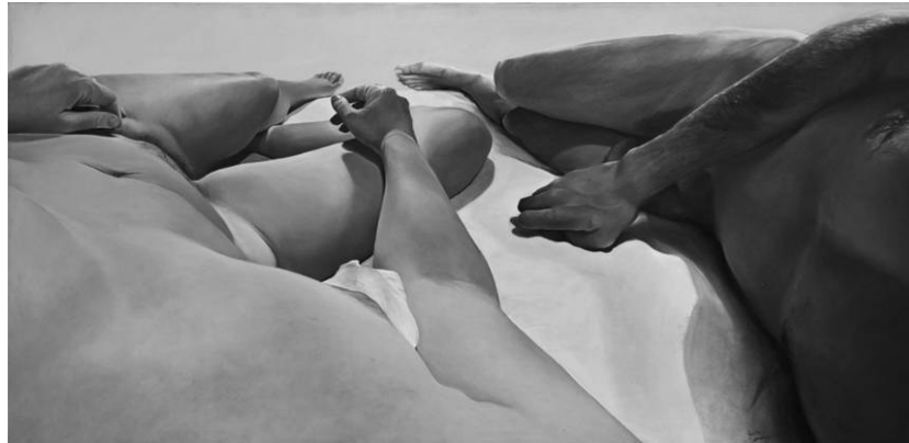
Figure 1 Joan Semmel, Antonio and I (1974), oil on canvas, 48 × 78 inches. © Joan Semmel. Reprinted with permission. Color version available as an online enhancement.

rather than traditional painting and sculpture; art as collaborative practice rather than the product of individual male genius; and art that blurs the boundaries between craft, popular culture, and high art. 5