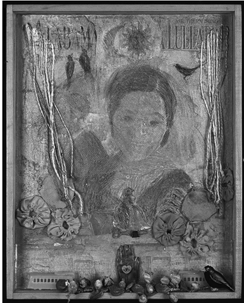
Figure 4 Betye Saar, Victory of Gentleness (for Rosa Parks) (1975), mixed media assemblage, 13 3/8 × 11 1/8 × 1 inches. © Betye Saar. Courtesy of Michael Rosenfeld Gallery LLC, New York. Reprinted with permission. Color version available as an online enhancement.

to continuing modes of racial discrimination and the unsung heroism of enslaved women to the practices of nonviolent resistance. Anticipating postmodernism's blurring of boundaries, the assemblage is both bounded and open, fusing surface and depths, while merging iconographies of the altar, the window, and the dressing table.