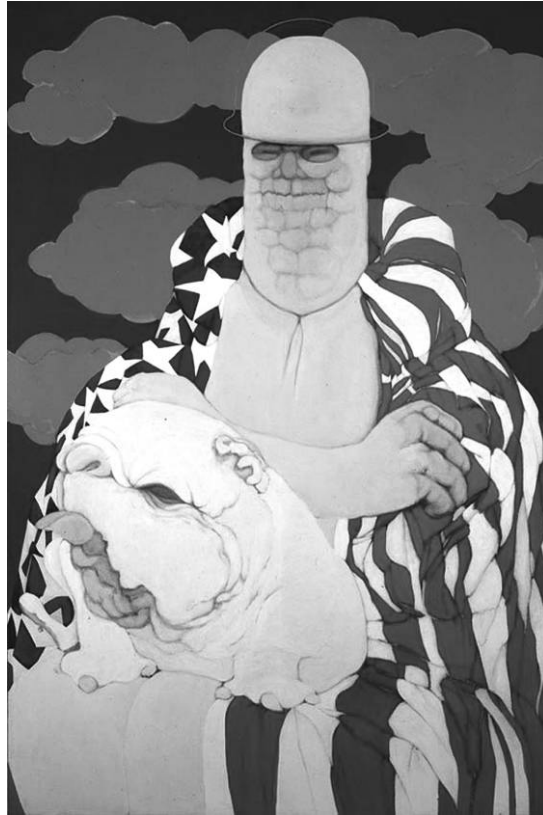
Figure 3 May Stevens, Top Man (1975), acrylic on canvas, 60 × 40 inches. © May Stevens. Reprinted with permission. Color version available as an online enhancement.

thority figures while providing a trenchant critique of U.S. imperial pretensions. Her male authority figure is bald with a bullet-shaped (or phallic) head and pig eyes. He sits frontally in the style of a medieval icon with his potbelly prominently displayed and holding a menacing bulldog. Stevens uses his smug smile and complacent corpulence to embody and lampoon American hegemony.