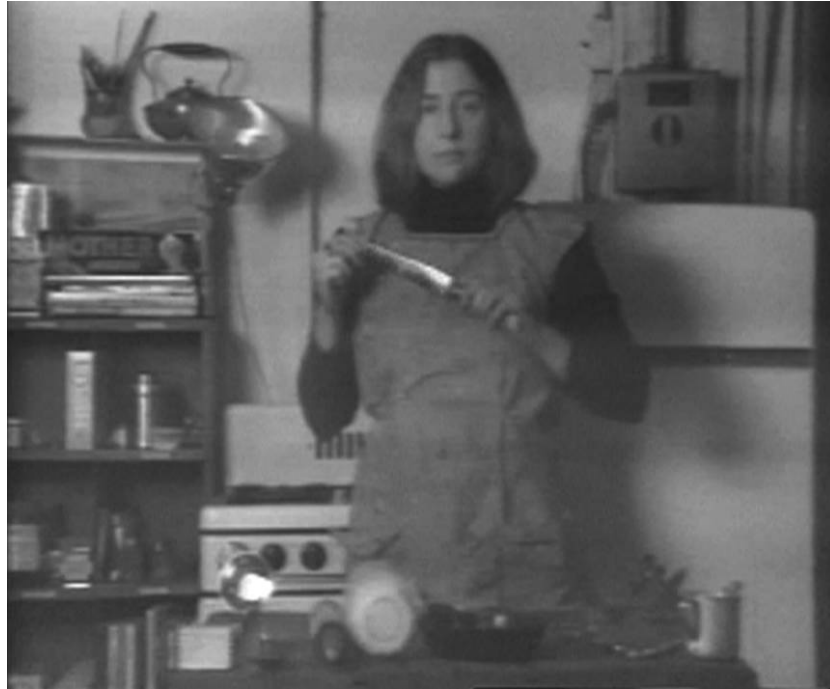
Figure 2 Martha Rosler, Semiotics of the Kitchen (1975), still from video performance piece. © Martha Rosler. Reprinted with permission.

satirizes the social construction of women as homemakers. Donning a ruffled apron, Rosler engages the absurdity of housewifery by presenting kitchen tools to the viewer in alphabetical order, naming each implement—“egg beater,” “knife,” “spoon”—and pantomiming how each is used in a way that emphasizes her underlying rage and potential for violence. Challenging notions of art as sublime, Rosler introduces performance art and video as media to illuminate oppressive social relations embedded in daily life in order to trigger transformations of consciousness.