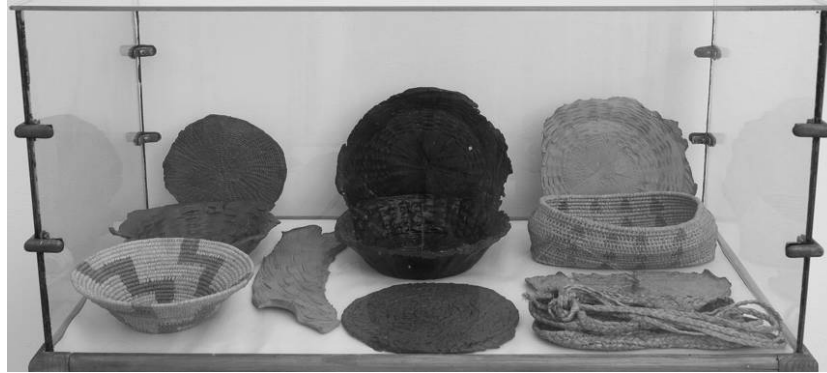
Figure 7 Harmony Hammond, Collection of Fragments, Baskets, and Sandals (1972–76), mixed media installation with fabricated clay shards, woven raffia and reed baskets, sandals, and display case (dimensions variable). © Harmony Hammond. Courtesy of the artist and Dwight Hackett projects. Reprinted with permission. Color version available as an online enhancement.