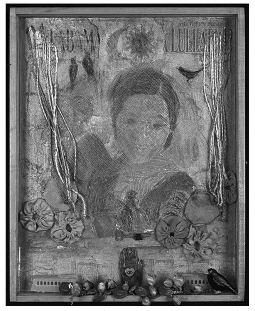
Figure 4 Betye Saar, Victory of Gentleness (for Rosa Parks) (1975), mixed media assemblage, 13 3/8 \times 11 1/8 \times 1 inches. Color version available as an online enhancement.

to continuing modes of racial discrimination and the unsung heroism of enslaved women to the practices of nonviolent resistance. Anticipating postmodernism's blurring of boundaries, the assemblage is both bounded and open, fusing surface and depths, while merging iconographies of the altar, the window, and the dressing table.