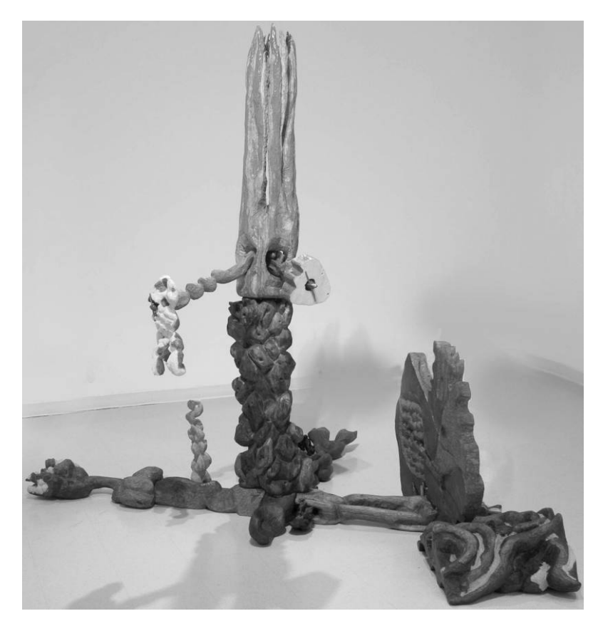
Figure 6 Nancy Azara, Widows' Tongues (1974), painted wood, 8 \times 9 feet. © Nancy Azara. Reprinted with permission. Color version available as an online enhancement.

space rather than closing off their surroundings, interacting with the air around them much as human limbs actually do.