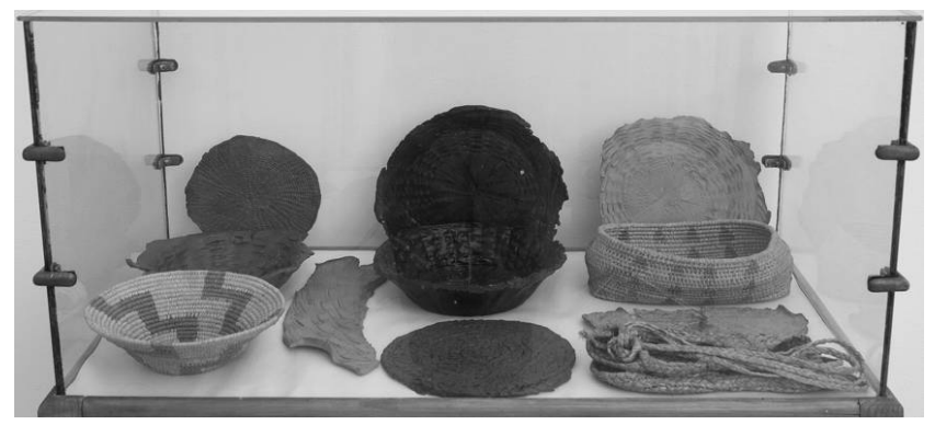
Figure 7 Harmony Hammond, Collection of Fragments, Baskets, and Sandals (1972–76), mixed media installation with fabricated clay shards, woven raffia and reed baskets, sandals, and display case (dimensions variable). © Harmony Hammond. Courtesy of the artist and Dwight Hackett projects. Reprinted with permission. Color version available as an online enhancement.