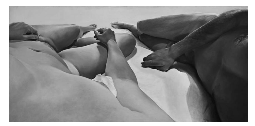
Figure 1 Joan Semmel, Antonio and I (1974), oil on canvas, 48 \times 78 inches. © Joan Semmel. Reprinted with permission. Color version available as an online enhancement.

rather than traditional painting and sculpture; art as collaborative practice rather than the product of individual male genius; and art that blurs the boundaries between craft, popular culture, and high art.<sup>5</sup>