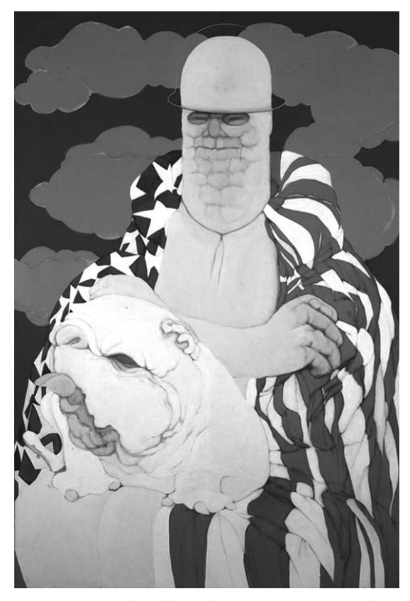
Figure 3 May Stevens, Top Man (1975), acrylic on canvas, 60 \times 40 inches. © May Stevens. Reprinted with permission. Color version available as an online enhancement.

thority figures while providing a trenchant critique of U.S. imperial pretensions. Her male authority figure is bald with a bullet-shaped (or phallic) head and pig eyes. He sits frontally in the style of a medieval icon with his potbelly prominently displayed and holding a menacing bulldog. Stevens uses his smug smile and complacent corpulence to embody and lampoon American hegemony.