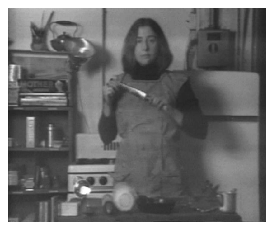
Figure 2 Martha Rosler, Semiotics of the Kitchen (1975), still from video performance piece. © Martha Rosler. Reprinted with permission.

satirizes the social construction of women as homemakers. Donning a ruffled apron, Rosler engages the absurdity of housewifery by presenting kitchen tools to the viewer in alphabetical order, naming each implement—"egg beater," "knife," "spoon"—and pantomiming how each is used in a way that emphasizes her underlying rage and potential for violence. Challenging notions of art as sublime, Rosler introduces performance art and video as media to illuminate oppressive social relations embedded in daily life in order to trigger transformations of consciousness.